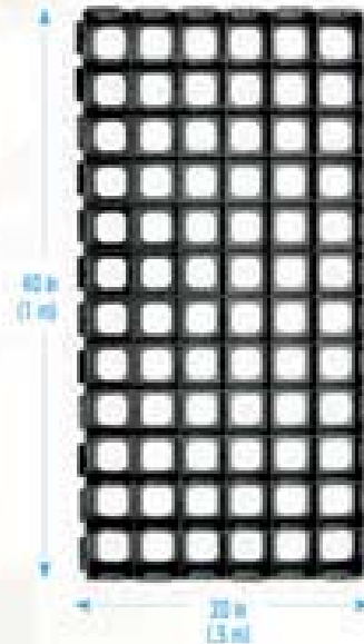
GEOBLOCK® CELL AND INTERLOCKING OFFSET TAB: